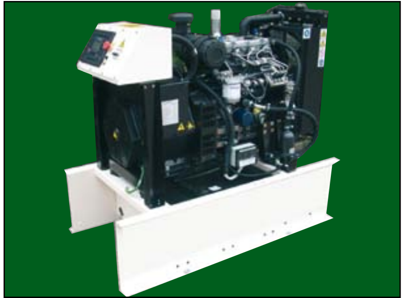
Genset photograph may include optional extras