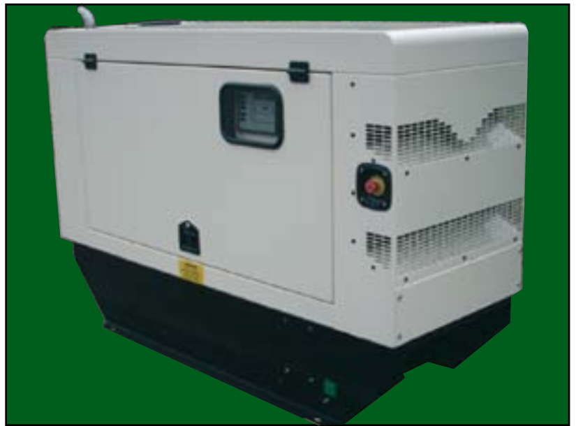
Genset photograph may include optional extras