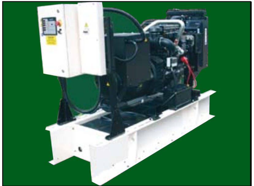
Genset photograph may include optional extras