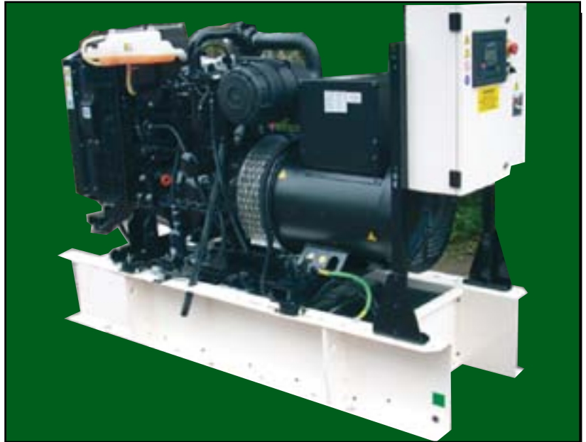
Genset photograph may include optional extras