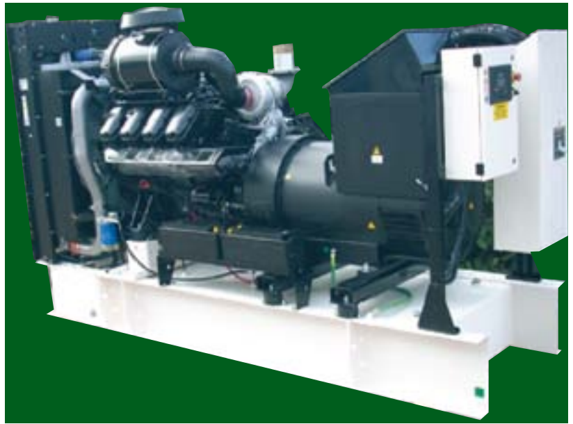
Genset photograph may include optional extras