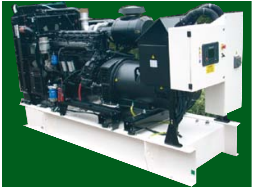
Genset photograph may include optional extras