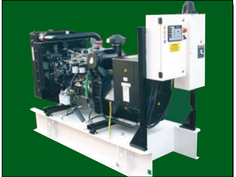
Genset photograph may include optional extras