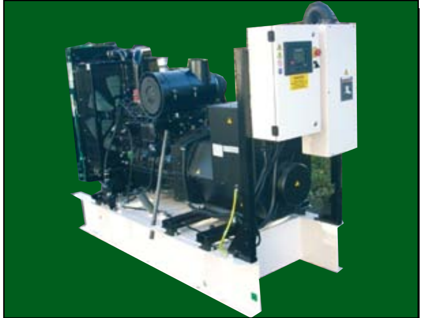
Genset photograph may include optional extras