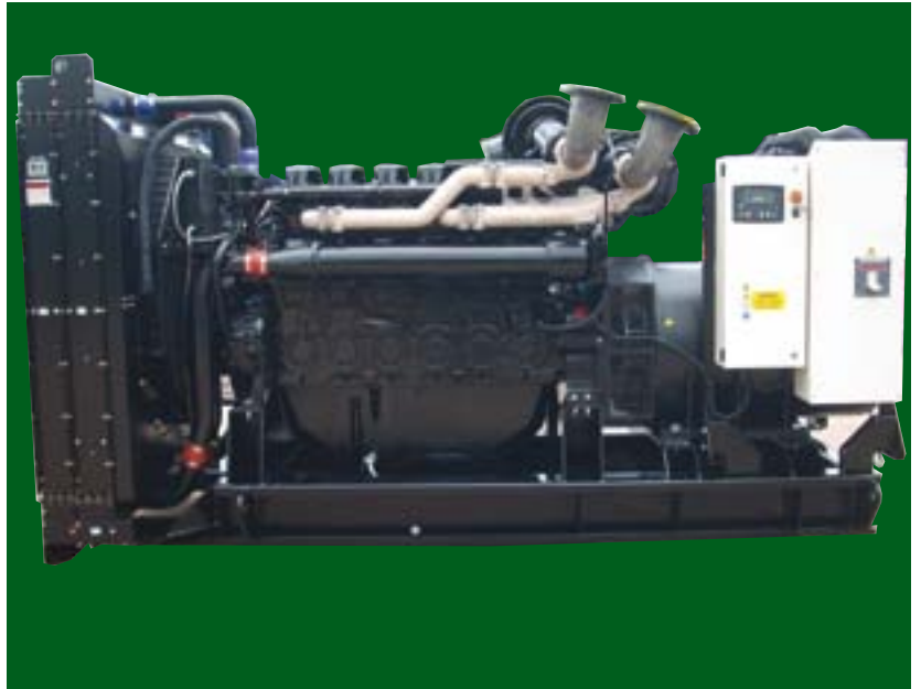
Genset photograph may include optional extras