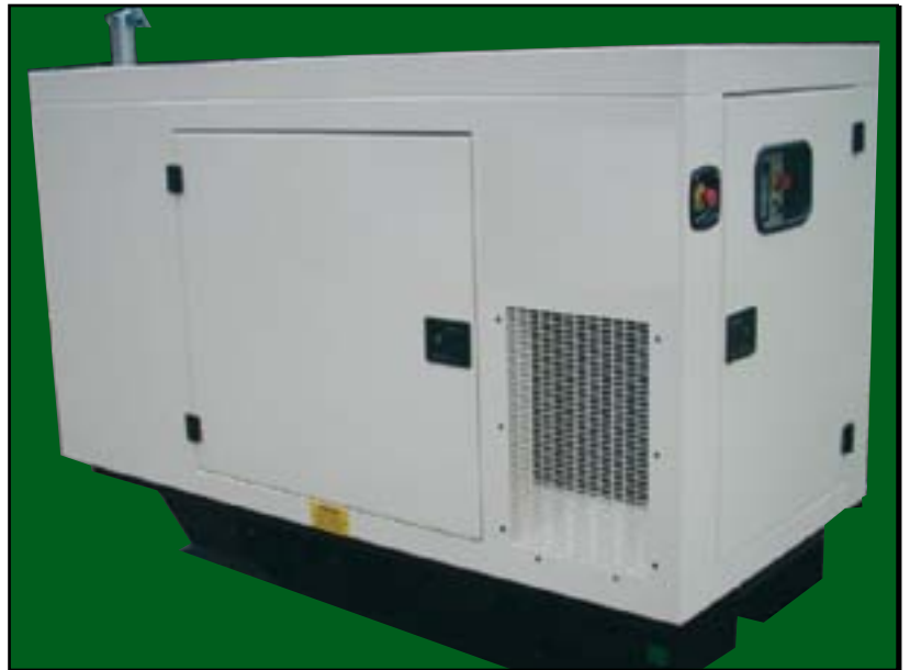
Genset photograph may include optional extras