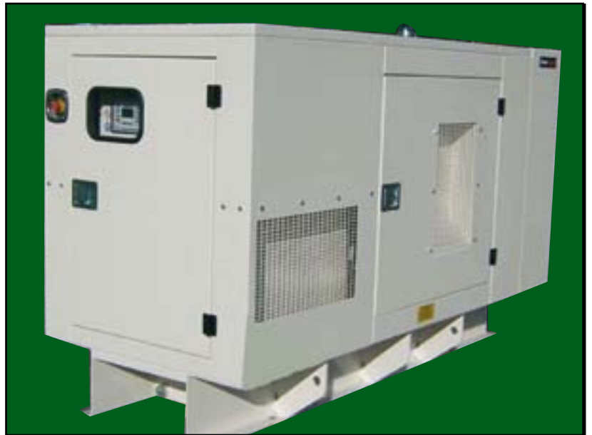
Genset photograph may include optional extras