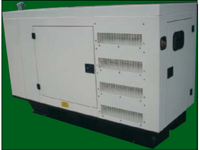
Genset photograph may include optional extras