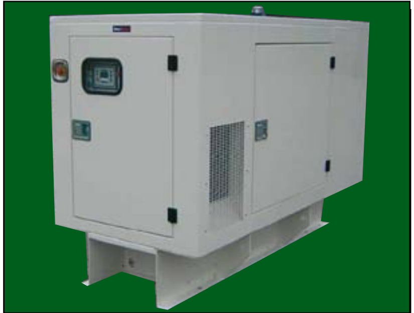
Genset photograph may include optional extras