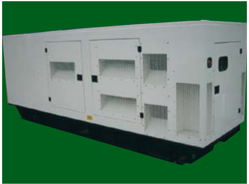
Genset photograph may include optional extras