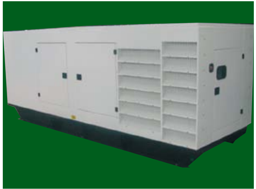
Genset photograph may include optional extras