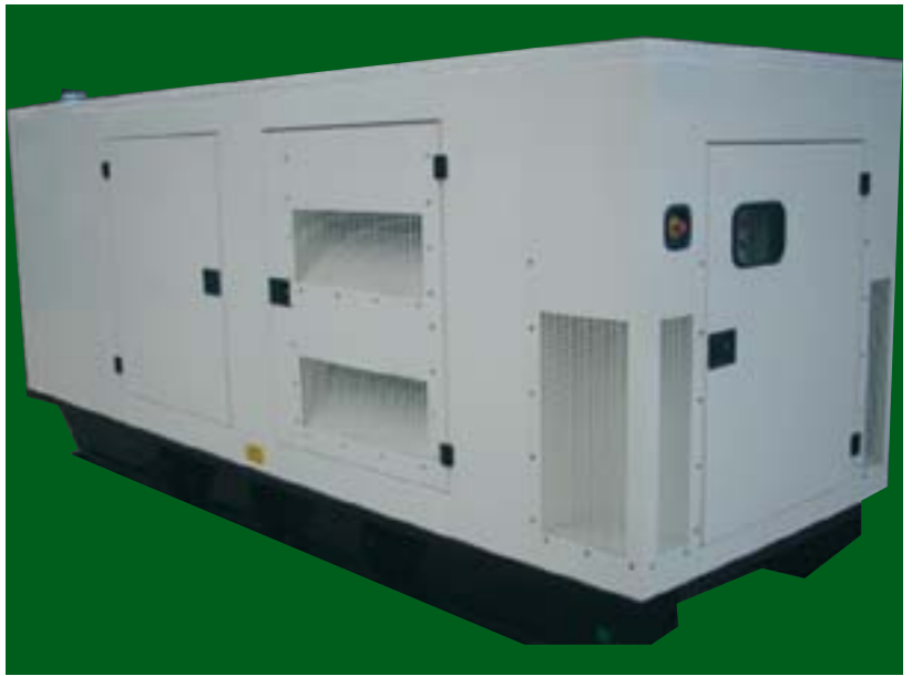
Genset photograph may include optional extras