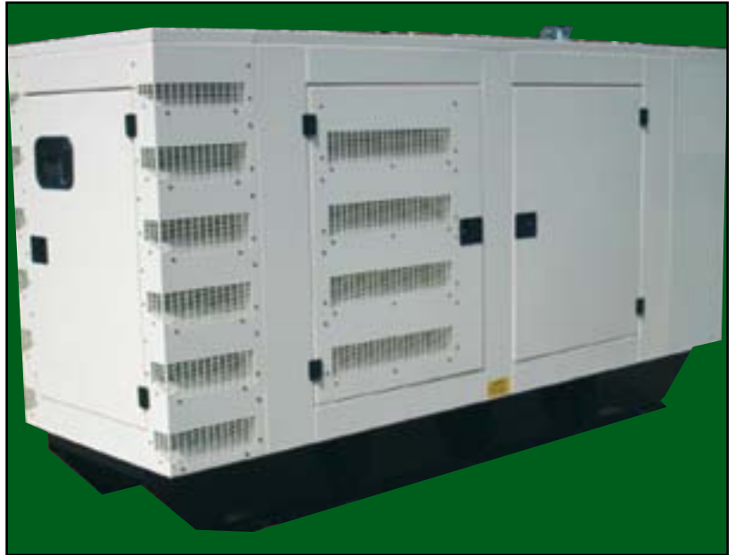
Genset photograph may include optional extras