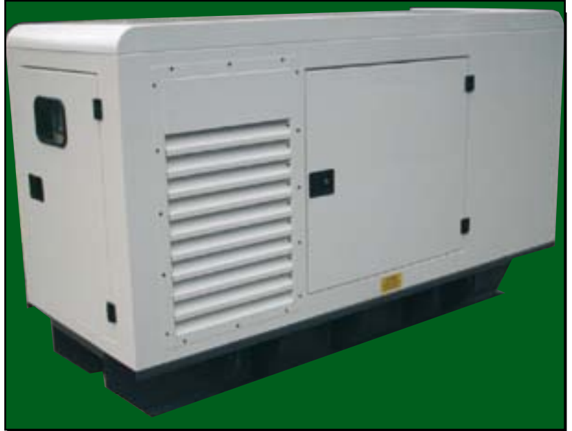
Genset photograph may include optional extras