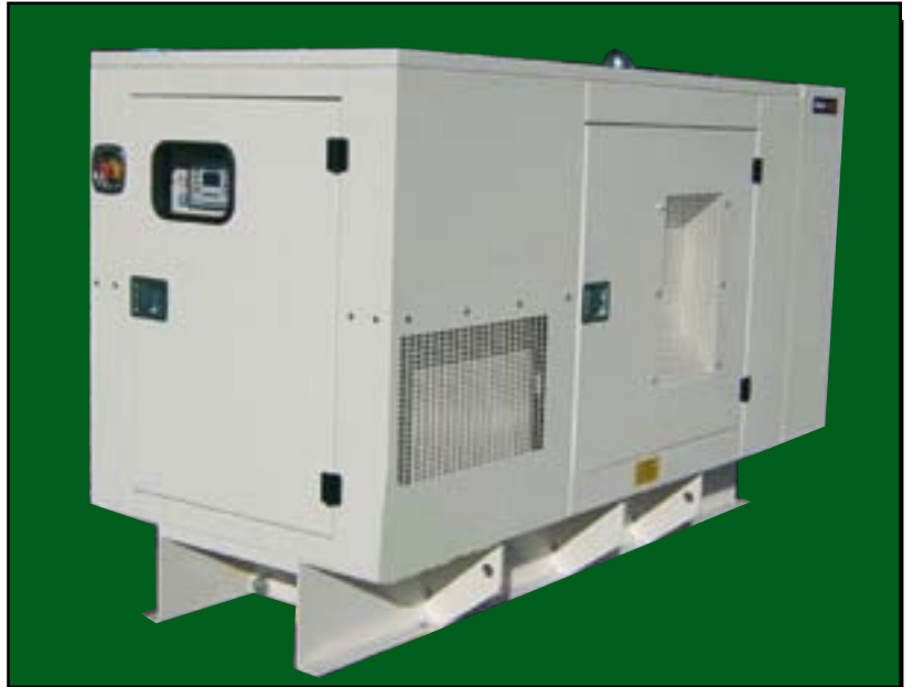
Genset photograph may include optional extras